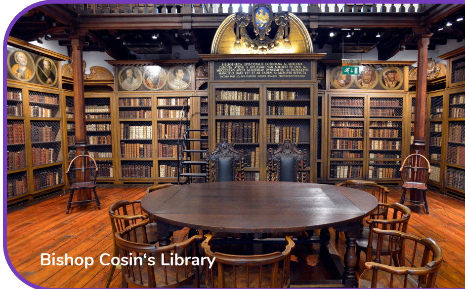
Bishop Cosin's Library

Bishop Cosin's Library (11am-3pm Sat. and Sun.) One of the earliest 'public' libraries Conservation work completed 2022 Enter from within Palace Green Library Booking of tickets on-line or through reception at Palace Green Library Tel. 0191 334 2932 Free