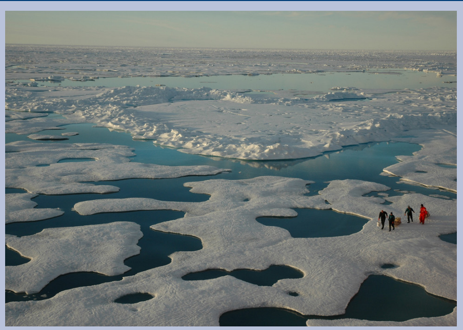
Scientists in an endless vista of ice, sea, and melt water as seen from the USCG Icebreaker HEALY. Arctic Ocean, Canada Basin. July 22, 2005.

For more information on the ICE LAW Project, see http://icelawproject.org.