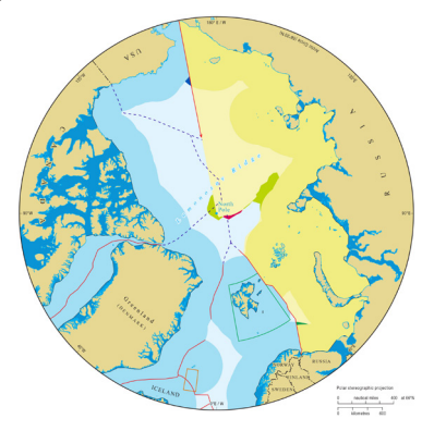
A second, simplified map has been created to show the difference between the Russian claim submitted on 3 August 2015 and their original claim in 2001.

https://www.durham.ac.uk/ibru/resources/arctic/