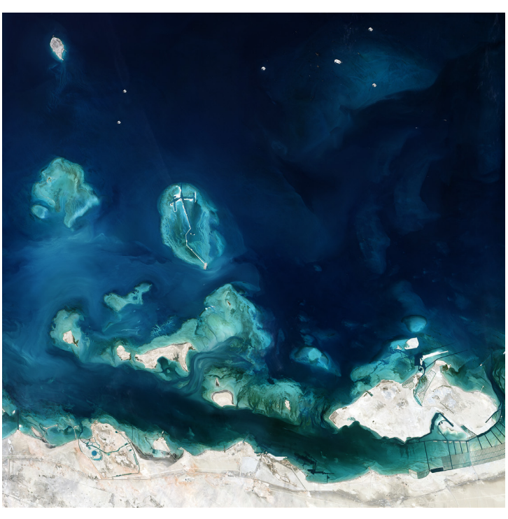
Islands of the Coast of the United Arab Emirates