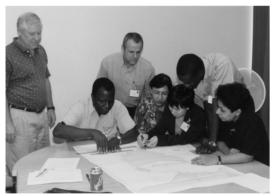
A group working on the Maritime Delimitation exercise

These workshops organised and hosted by IBRU in Durham are part of our annual training programme. Both workshops were voted a great success by the 30 plus participants. Coming from the US, Latin America and the Caribbean, Europe, the Middle East, Sub-Saharan Africa and the Far East, participants included diplomats and negotiators, lawyers, technical experts and government officials.