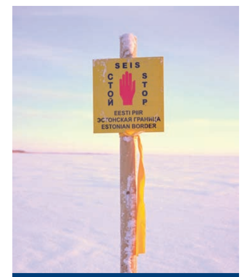
Sign on the Estonia-Russia boundary