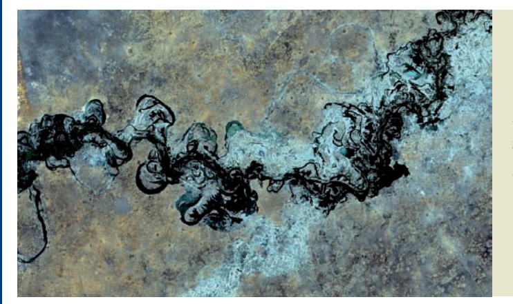
Satellite imagery reveals the complex geomorphology of the Komadugu Yobe river which forms part of the boundary between Nigeria and Niger (Landsat ETM+ image, 2000.).

River boundaries are now a major focus of IBRU's research activities. A database containing information on more than 1,200 river boundary sections around the world will be published on the Unit's website later in 2008, along with an article in the journal Water Policy. In July we will also be repeating the successful training workshop first run in September 2005 on the theme 'River Boundaries: Practicalities & Solutions' (see page 3 for further details). Our long-term aim is to develop a toolkit to assist in the delimitation, demarcation and management of river boundaries, and we would encourage readers with practical experience of these activities to contribute to this project.