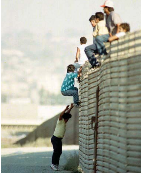
A group of illegal Mexican immigrants are seen leaping from the border fence to enter the United States, near Tijuana, Mexico