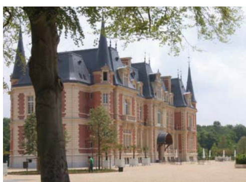
Les Fontaines, the venue for the Boundary Management Workshop

To make an enquiry about our workshops, please contact Liz Kennedy Tel: +44 191 334 1965 Email: ibru-events@durham.ac.uk or book online at www.durham.ac.uk/ibru/workshops