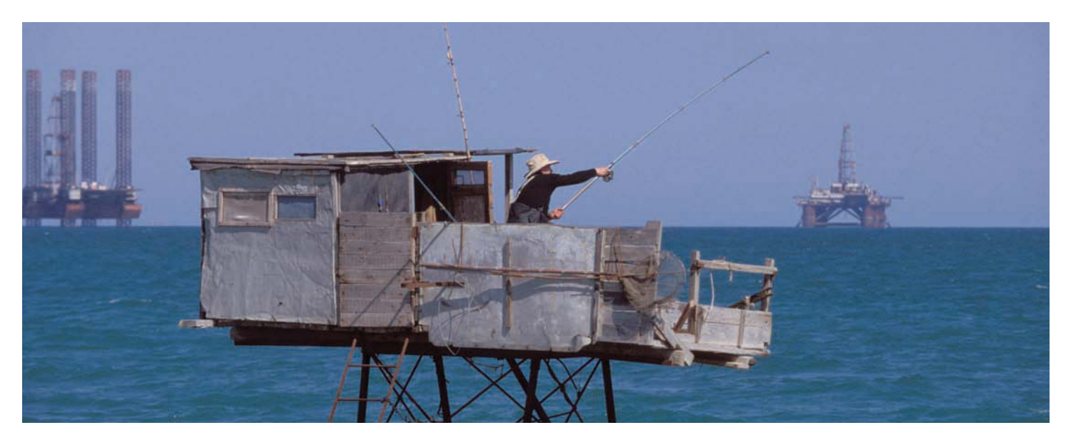
Fisherman off the coast of Azerbaijan in the Caspian Sea, with oil installations just a few miles offshore. The sea bed boundaries in the northern Caspian have been agreed, facilitating major oil and gas operations. However, Azerbaijan, Turkmenistan and Iran have failed to agree boundaries in the southern Caspian and continue to vie for control over hydrocarbon resources and valuable fish stocks.

While the element of national pride and identity remains closely linked with a state's territory, natural resources also remain of vital importance to states around the world. Throughout 2009, the resources of border and peripheral areas often took centre stage in events related to international land and maritime boundaries and limits.