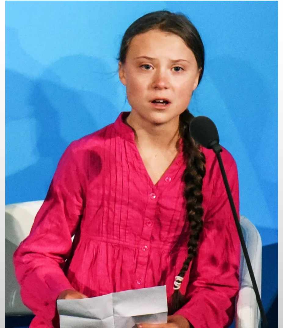
Greta Thunberg, Facebook post, International Women’s Day, March 8 2019